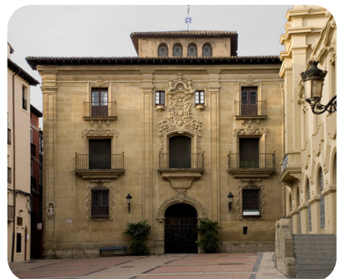
Museo de La Rioja