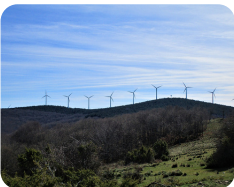
“La Hez” mountains