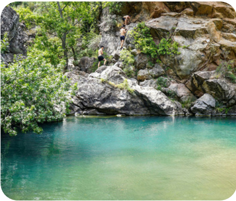
Pozas de Jubera