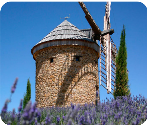
Molino de Santa Lucía