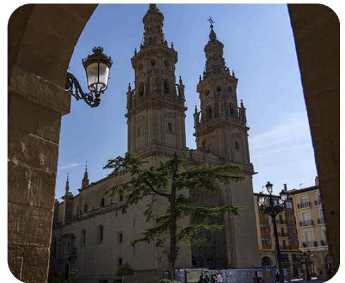
Plaza del Mercado